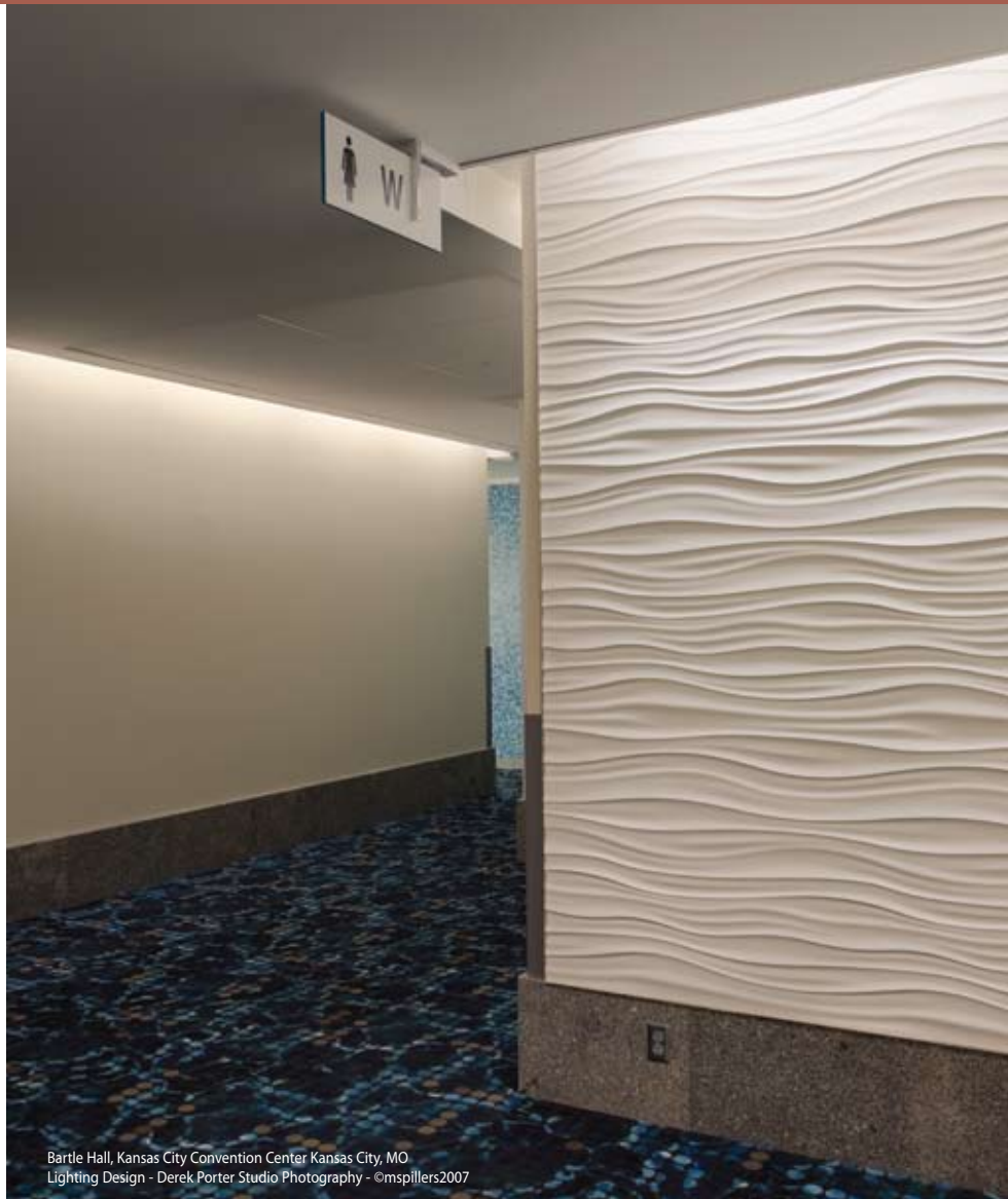
Bartle Hall, Kansas City Convention Center Kansas City, MO Lighting Design - Derek Porter Studio